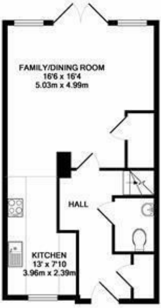
GROUND FLOOR APPROX. FLOOR AREA 483 SQ. FT. (44.9 SQ. M.)

A stunning four double bedroom town house situated in a popular modern development in West Drayton. Arranged over three floors this exceptional show home offers double bedrooms with an en suite to the master room, a family bathroom and an additional downstairs wc. Reception room with patio doors leading to a private garden, a luxury fitted kitchen with integrated appliances and allocated parking. Landscaped communal gardens an on site supermarket. Commuting could not be easier with the U5 bus route and the West Drayton Mainline station within walking distance. Easy access to Stockley business park, Heathrow and Uxbridge. Generously furnished to an exquisite standard, available November.