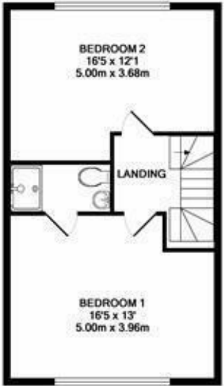
2ND FLOOR APPROX. FLOOR AREA 475 SQ. FT. (44.1 SQ. M.)

TOTAL APPROX. FLOOR AREA 1432 SQ. FT. (133.1 SQ. M.)